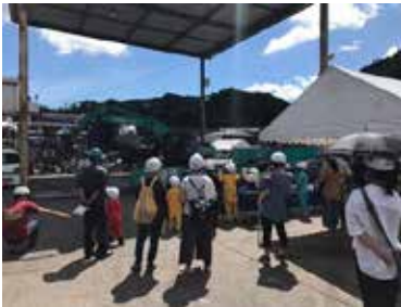
Participants gain more knowledge about automobile recycling, center.