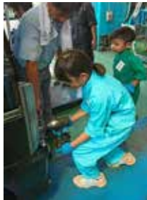
Children participated in recycling work involving parts detachment from a vehicle, left.