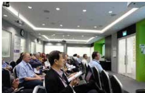
WRS 2017 took place at the Advanced Remanufacturing Technology Centre, Singapore, which was constructed in 2015.