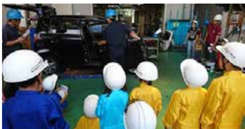
Participants visit recycling workplace