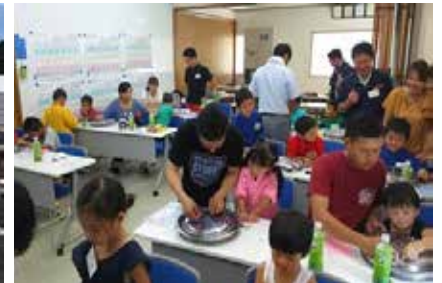
Workshop for clock craftwork using wheel caps, right.