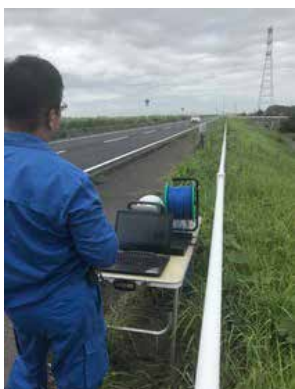
A street inspection using a portable reader of license plate numbers

Defective vehicles were also detected by the test run. Nine vehicles were inspected out of which, five vehicles were issued maintenance instructions, including an instruction in light of excessive loading for a dump truck with “insert frame.” ( Daily Automotive News, Sept. 18 issue )