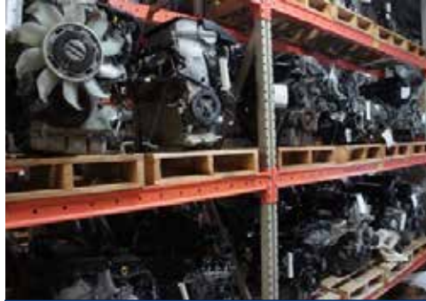
Guarantee applies to parts inventory and facility damages