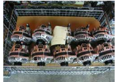
Quality of rebuilt parts parallels that of new parts

The recycled parts industry promotes their products to end users (car owners) and repair shops. The use of recycled parts produces less carbon dioxide (CO2) according to the lifecycle assessment (LCA) than that of new parts (genuine parts). However, consumer awareness of recycled parts is still very low. The industry, backed by this summer’s extreme heat, may gear up its efforts to raise awareness ( Daily Automotive News, Sept. 18 issue ).