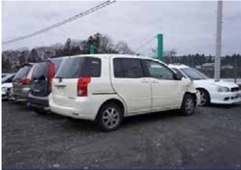
It covers various fields related to automotive recycling

Published by JARA Corporation Tokyo Head Office: 1 F. Yaesu KT Bldg. 1-1-8, Yaesu, Chuo-ku, Tokyo JAPAN 103-0028 Phone: +81 3 3548 3010 / Fax: +81 3 3231 4690