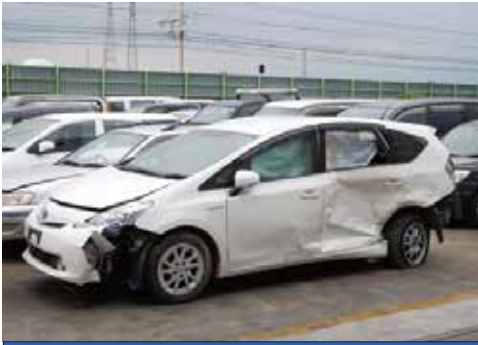
The basic rule of automobile recycling is to be done in the domestic market