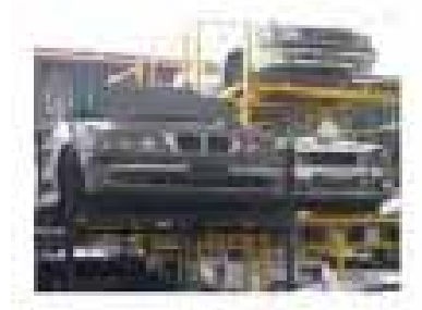
優れたサービス Excellent Service 服务卓越