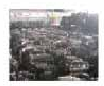
低価格 Resonable Price 价格合理